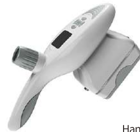
Handle I Standard

Apply Treatment for Body Shaping, Cellulite and Fat Reduction