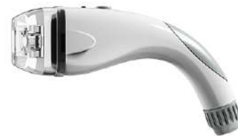
Handle III Standard

For Face, Neck and Chest; Face lifting, skin rejuvenation, wrinkle removal, anti-aging.