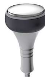
Handle Cavitation Optional

Cavitation is the use of ultrasound technology to break down fat cells below the skin. It is a non-surgical method of reducing cellulite and localized fat.