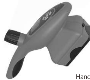
Handle I Standard

Apply Treatment for Body Shaping, Cellulite and Fat Reduction