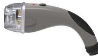
Handle III Standard

For Face, Neck and Chest; Face lifting, skin rejuvenation, wrinkle removal, anti-aging.