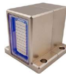
1200W Laser Bars from America Coherent

The Diode Laser bars imported from America Coherent, 2 times lifespan than others. With Large Spot 10*25mm, it facilitates increased treatment coverage to significantly reduce treatment time and make the process easier and safer for patients.